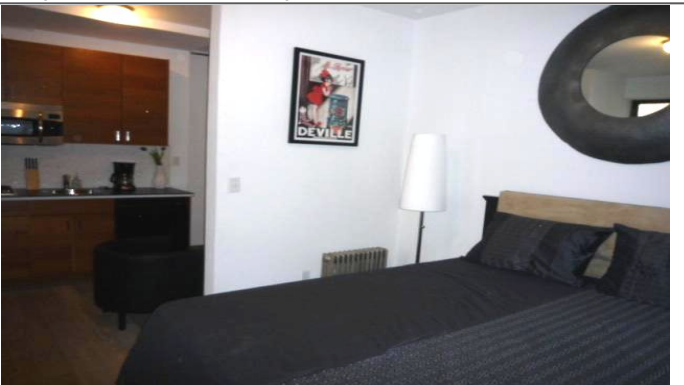
West Village Studio $3060/month

Based on 30 day minimum stays including utilities and taxes. Rates vary by season and availability.