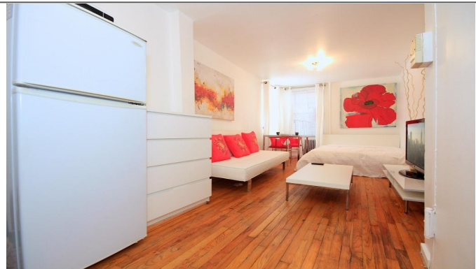
East Village - Studio $3120/month