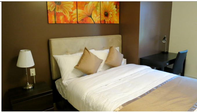
Chelsea - Shared Apt (Private Room) $2760/month