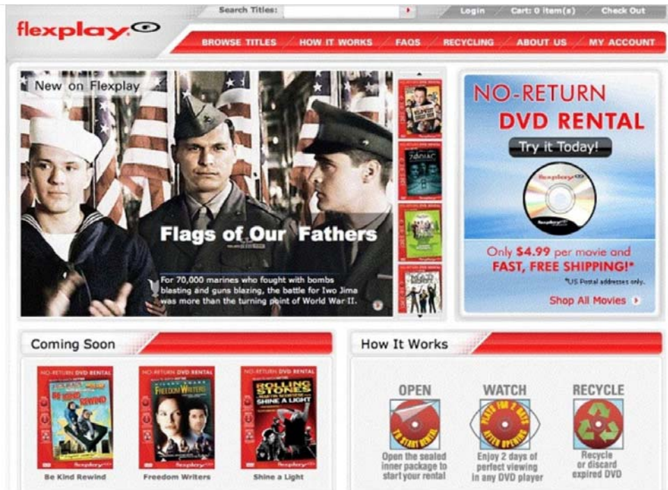
Figure 1. Screenshot of old Flexplay.com home screen 3 Flexplay is an optical disc that is DVD-compatible. An

optical disc is a flat, usually circular disc that encodes binary data, in the form of bits, which are binary digits. The encoding material sits atop a thicker substrate, usually made of a pure polycarbonate plastic. This substrate makes up the bulk of the disc. Optical media "use laser technology for recording, storing, and reproducing digital data." 4 In order to read the data, a reflective surface is required. This surface is usually a thin backing of aluminum. The layer is protected by a transparent coating. 5 The light from the laser that is directed on the optical disc, or storage medium, "changes the plastic and