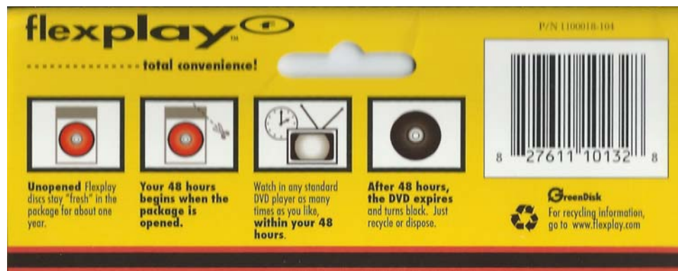
Figure 4. Flexplay Disc Instructions 19

The packaging also advises viewers to visit www.flexplay.com for more information about recycling.