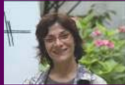
Catherine Lorente Library