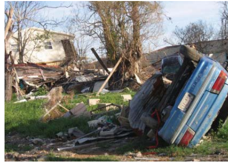
9th Ward car, New Orleans