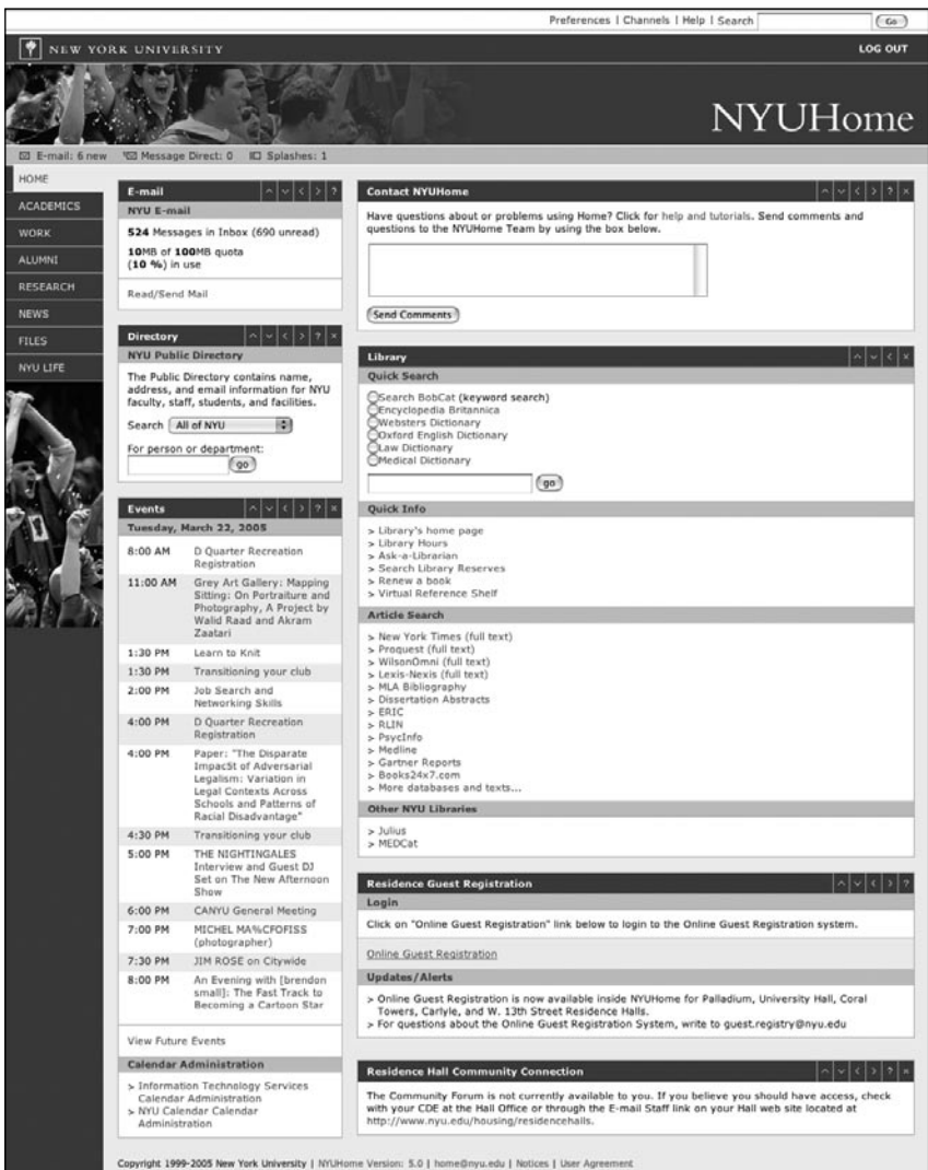
Figure 2. The current vision for NYUHome v. 5.0, featuring a colorful new design, improved site navigation, and greater web browser compatibility.

Keep an eye on NYUHome ( http://home.nyu.edu ) for version 5.0, coming soon, and be sure to let us know what you think!