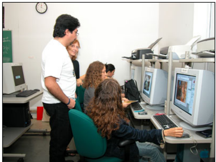
Figure 1. At the Encuentro , as part of a Digital Photography Workshop taught by Lorie Novak, Chair of the Photography and Imaging Department (TSOA), participants select images to hang in their final photo exhibit.

This year's Encuentro focused on the interplay between religion and political power, and featured an impressive collection of lectures, live performances, installations,