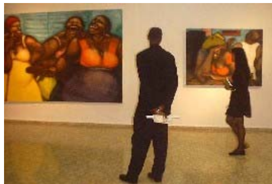
Painting by Christine Matuschek

In speaking with the owners of two local art galleries, I was informed that more than 90% of their sales are to tourists. This is a double-edged sword. While good economically, it also means that most of Grenada's art is being carried away from Grenada - never to be seen by the next generation. This leads to yet another investment that must be made; a permanent space for the visual arts to be displayed in Grenada. This should take the form of a National Museum for Visual arts, including additional space for an educational component. The Grenada Art Council for the past five years has been collecting important pieces of Grenada's art with the concern that it be preserved for Grenadians. Unfortunately, the collection is in storage, because of lack of an adequate facility.