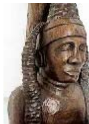
Carving by Wayne Snagg

In other words, we have much more to express than just the typical scene that a tourist may purchase for a souvenir.