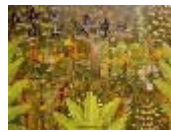
Painting by Elinus Cato

When considering an investment into a sustainable resource, the question will arise - what will be the benefit? Is this investment one that will continue to give yields far into the future?