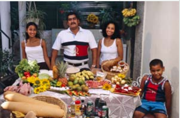
The Costas of Havana, Cuba, Family Portrait, c. 2005 from the ExhibitsUSA exhibition Hungry Planet: What the World Eats .

While it would be tempting to look for ways to consolidate federal international cultural exchange, or place primary responsibility in the State Department, this important sphere of activity transcends specific federal agencies or agency agendas. There is no question diplomacy can be much more effective in an environment nurtured by cultural exchange. Cultural exchange has significant public value in informing smart diplomacy: somebody, after all, has to go out and clear the brush to get the land ready for planting. But we see cultural exchange as broader than cultural diplomacy —even though the terms tend to be used interchangeably. Cultural exchange has broad educational, cultural, economic, and diplomatic goals.