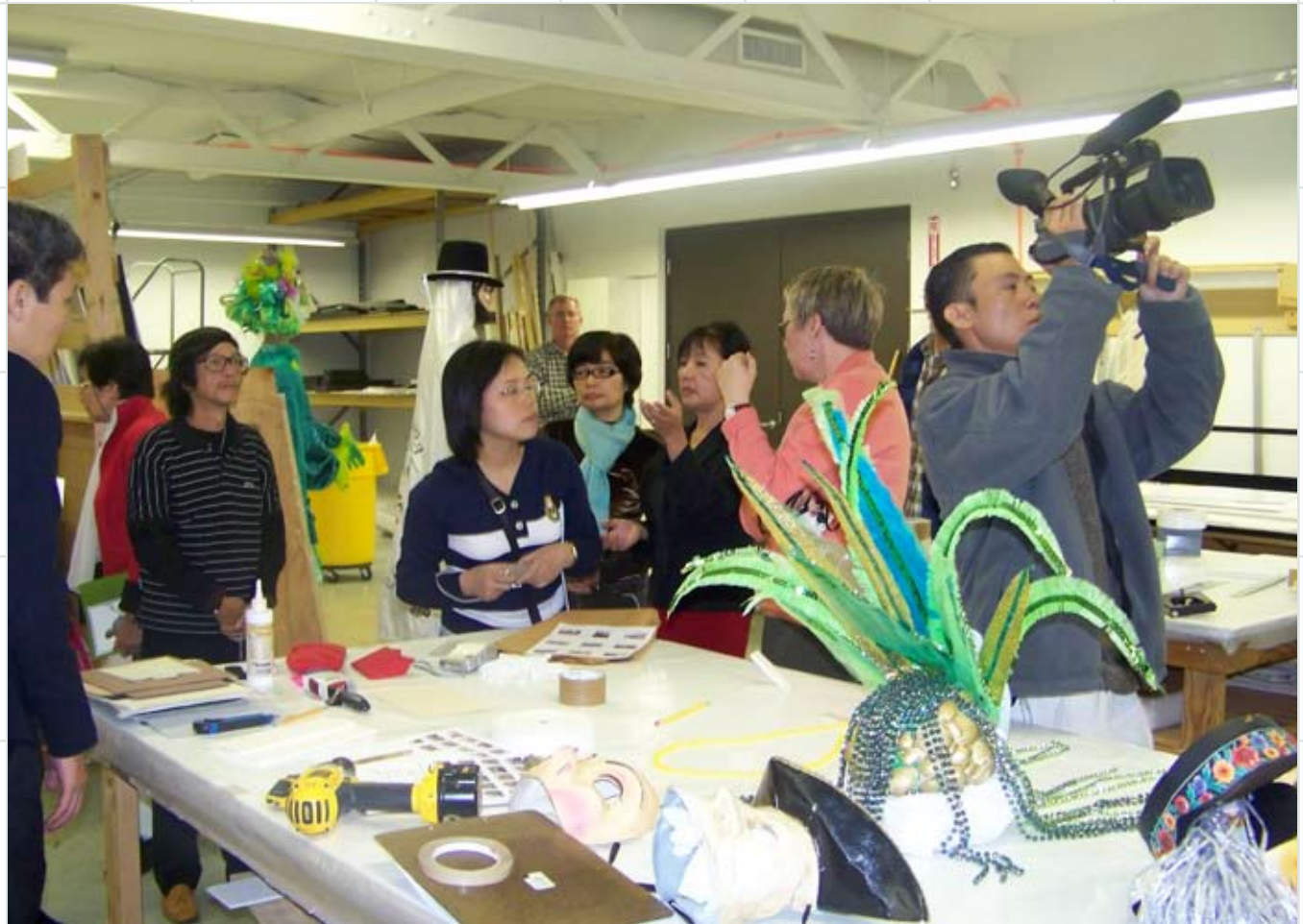
A delegation of Vietnamese artists and arts administrators tour Mid-America Arts Alliance's exhibition fabrication facilities in Kansas City, MO, 2008.

The U.S. RAOs are confident that this document will provide an essential resource to those charged with revitalizing federally supported cultural exchange programs. We stand ready to assist in the creation and implementation of a new approach to international cultural exchange by the United States. We believe our unique capabilities, perspectives, and experiences can be harnessed to an even greater extent to exponentially improve the quality and effectiveness of international cultural exchange programs.