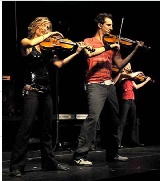
The international cast of Barrage performs at the Southern Arts Federation's Performing Arts Exchange, which attracts attendees from outside the U.S. including Mexico, Canada, Australia, and Ireland.