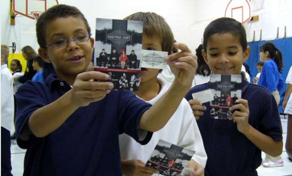
Excited students show off handouts from a workshop with French Canadian ensemble Mauvais Sort at a workshop in Elgin, IL, as part of Arts Midwest World Fest.