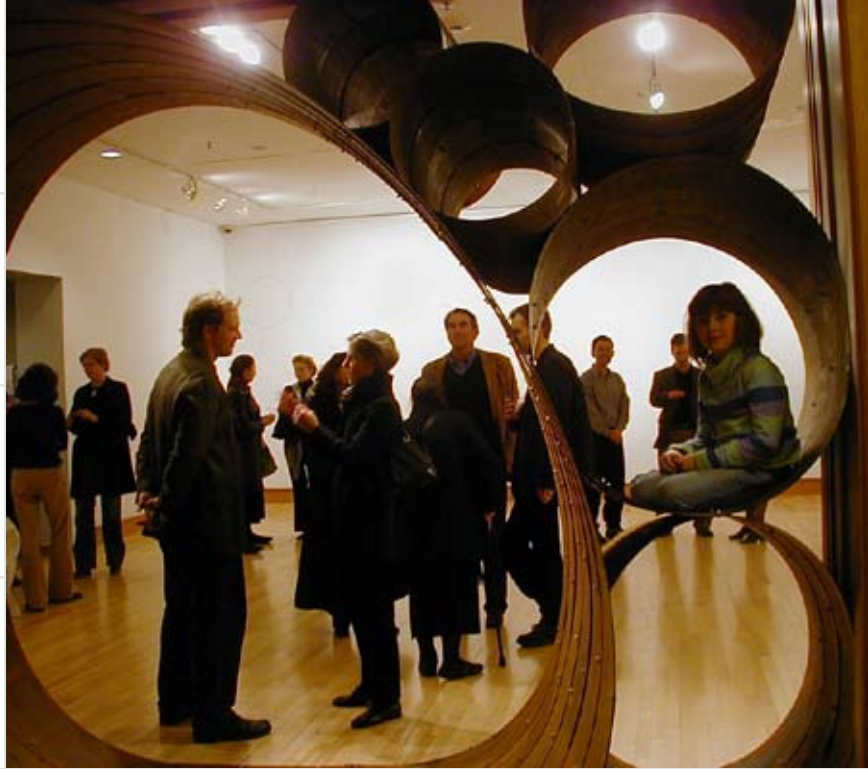
Public Art/Moving Site traveling public art project by Delwitt Godfrey, supported by NEFA.

The personal involvement of President Obama will be significant in retooling our international cultural exchange program. Inspiration and leadership from the “bully pulpit” of the White House is vital to the success of U.S. cultural exchange efforts and can build broad public support for public and private investment in cultural exchange programs. The White House can serve as a powerful venue for convening