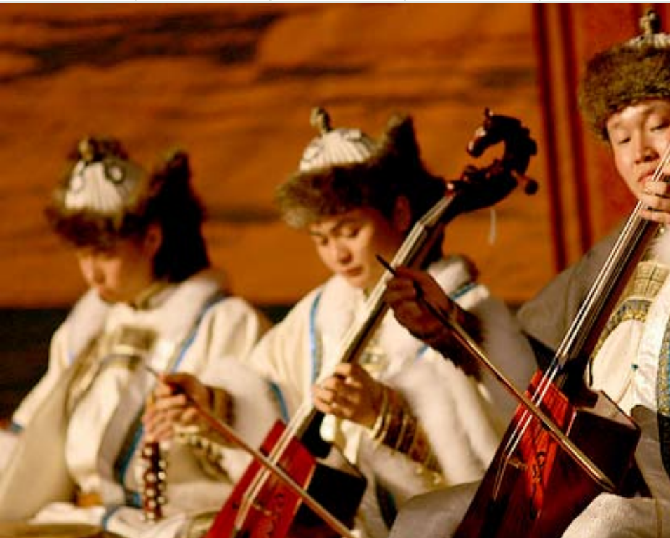
Musicians from the Inner Mongolian region of China play horse-head fiddles in a performance in Hutchinson, MN, as part of Arts Midwest World Fest.

Another key area for consideration by the Obama administration relates to visas and taxes. To bring more artists and arts administrators to the United States, we must ease their visa restrictions and improve tax procedures. The process to secure visas for non-U.S. artists is cumbersome and time consuming, often getting tied up in bureaucracy within the State Department and the Department of Homeland Security.