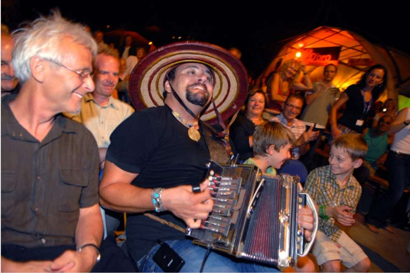
US Artists International artist Terrance Simien & the Zydeco Experience at the Stimmen Festival, Germany.

As for taxes, we have different tax treaties with nearly every country, and depending on that treaty, sponsors of in-bound artists (such as the U.S. RAOs) are supposed to withhold up to 35 percent of the contracted artist fee and pay that to the Internal Revenue Service. The artist must then file for a refund at the end of the year, a refund the artist may or may not receive. This is a significant disincentive for performing arts groups from other countries to want to visit the U.S.