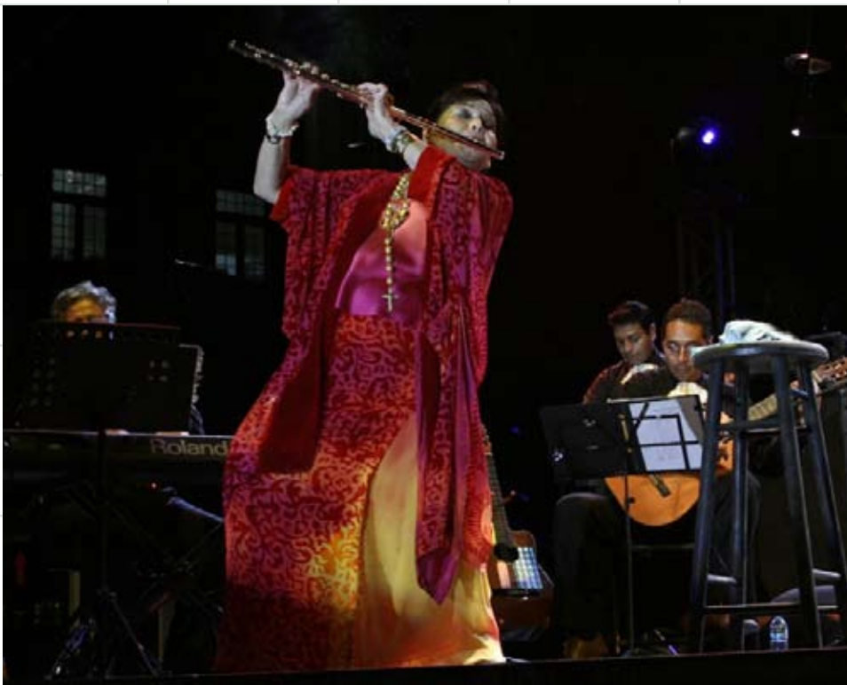
President's Committee of the Arts and Humanities presentation of Flauta Sin Fronteras U.S. Border Tour.

Interactive technologies can play a significant role in expanding networks of artists and arts administrators, especially when used to enhance and extend live artistic exchanges. Interactive technologies offer speed and accessibility, the ability to build online communities of artists, and the opportunity to share and archive live artistic experience. While online communities do not replace personal interaction between artists and audiences, they can in fact stimulate such interaction—in much the same way that the Obama campaign's groundbreaking use of new media spurred personal involvement in the campaign and participation in canvassing, phone banks, etc.