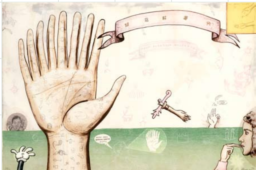
Enrique Chagoya, Hand of Power , 1997, Lithograph, from the ExhibitsUSA exhibition, Cardinal Points: A Survey of Contemporary Latino and Latin American Art , from the Sprint Nextel Art Collection.

A principal goal of this exhibition is to make visitors aware of the broad range of artistic approaches pursued by these artists. Despite the