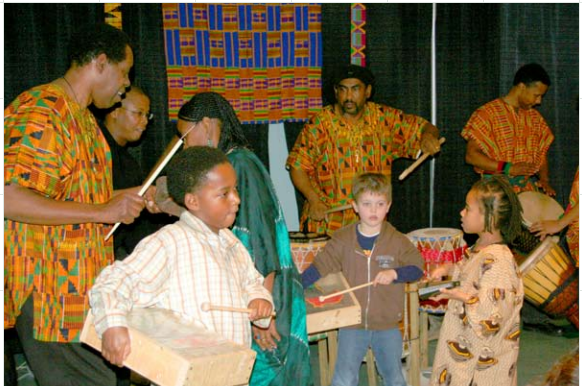
Opening reception for Wrapped in Pride: Ghanaian Kente and African American Identity at the Boonshoft Museum of Discovery, Dayton, OH, 2006.