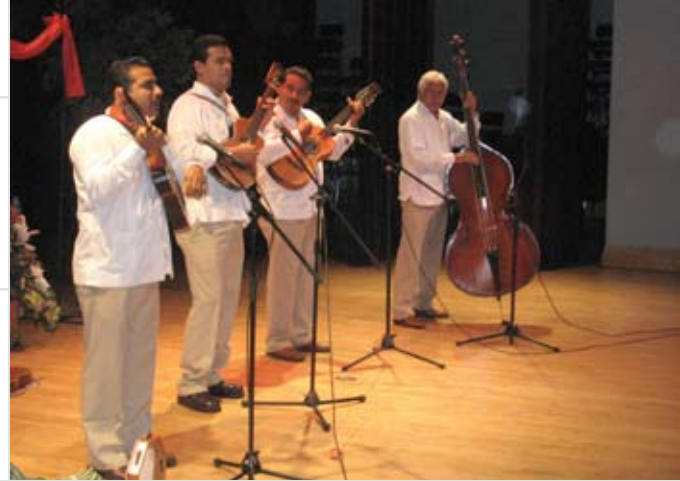
Grupo Siquisirí performs at Clayton County High School, Jonesboro, GA.