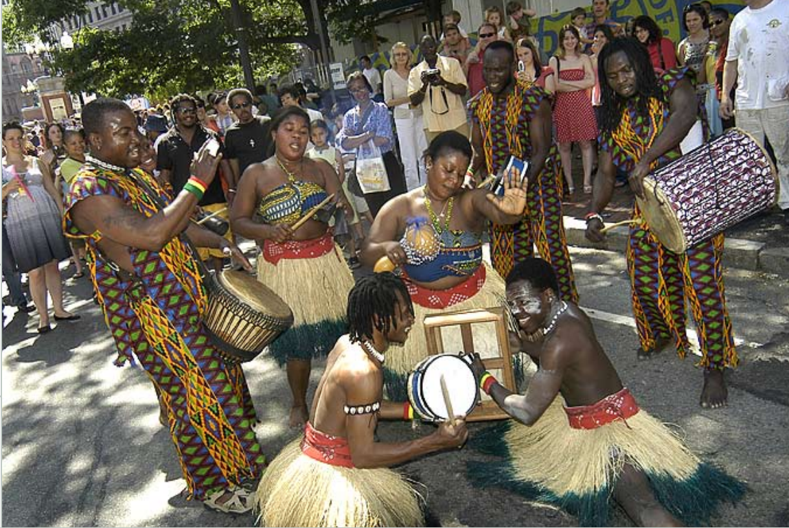
New Hampshire-based Akwaaba African Drum and Dance Ensemble, Ghana, performed at the FirstWorksKids Festival in Providence, RI (NEFA).