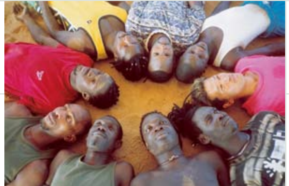
Senegal-based Company JANT-BI with Japanese choreographer Kota Yamasaki in preparation for a U.S. tour with Urban Bush Women as part of the National Dance Project of the New England Foundation of the Arts.