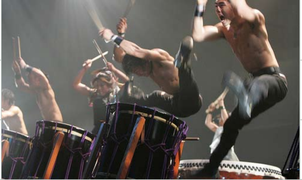
Japanese taiko ensemble TA0 performs in Chicago as part of the 3rd annual Global Rhythms Concerts in November 2007, presented by the Chicago Human Rhythm Project with support from Arts Midwest.