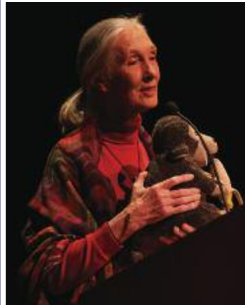
JANE GOODALL SPOKE AT STEINHARDT'S SCIENCE EDUCATION INNOVATORS EXPO & SYMPOSIUM.