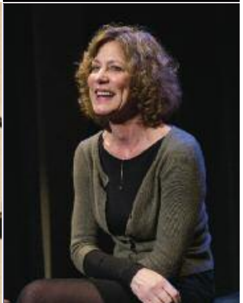
ACTRESS CHRISTINE LAHTI CONDUCTED A SCENE STUDY WORKSHOP FOR STUDENTS AT THE GALLATIN SCHOOL.