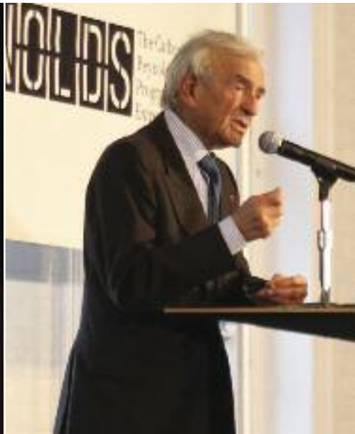
HOLOCAUST SURVIVOR AND NOBEL PRIZE-WINNER ELIE WIESEL LED THE REYNOLDS SPEAKER SERIES.