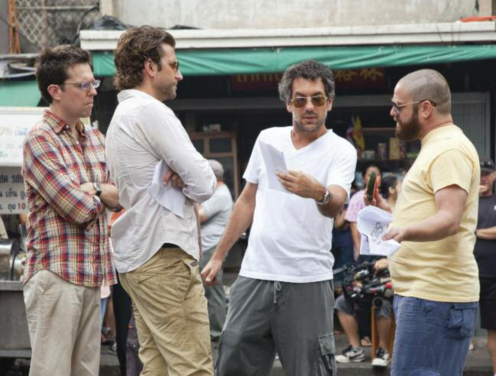
PHILLIPS (CENTER) SHOT THE HANGOVER PART II ON LOCATION IN BANGKOK, THAILAND, WITH STARS ED HELMS, BRADLEY COOPER, AND ZACH GALIFIANAKIS.

for the, in Phillips's words, "unapologetic and aggressive" comedy he would become famous for—such as Will Ferrell streaking in Old School . Borat (2006), which Phillips co-wrote and which Newsweek called "game-changing" for how warmly audiences received its utter political incorrectness, even earned an Oscar nomination (for Best Adapted Screenplay). "Other comedies that come out of Hollywood have bad behavior, but most of them spend the last 15 minutes of the movie apologizing for [it]," he says. "Movies that I make revel in the bad behavior."