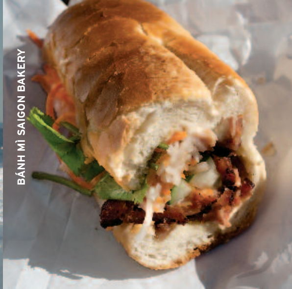
BÁNH MÌ SAIGON BAKERY