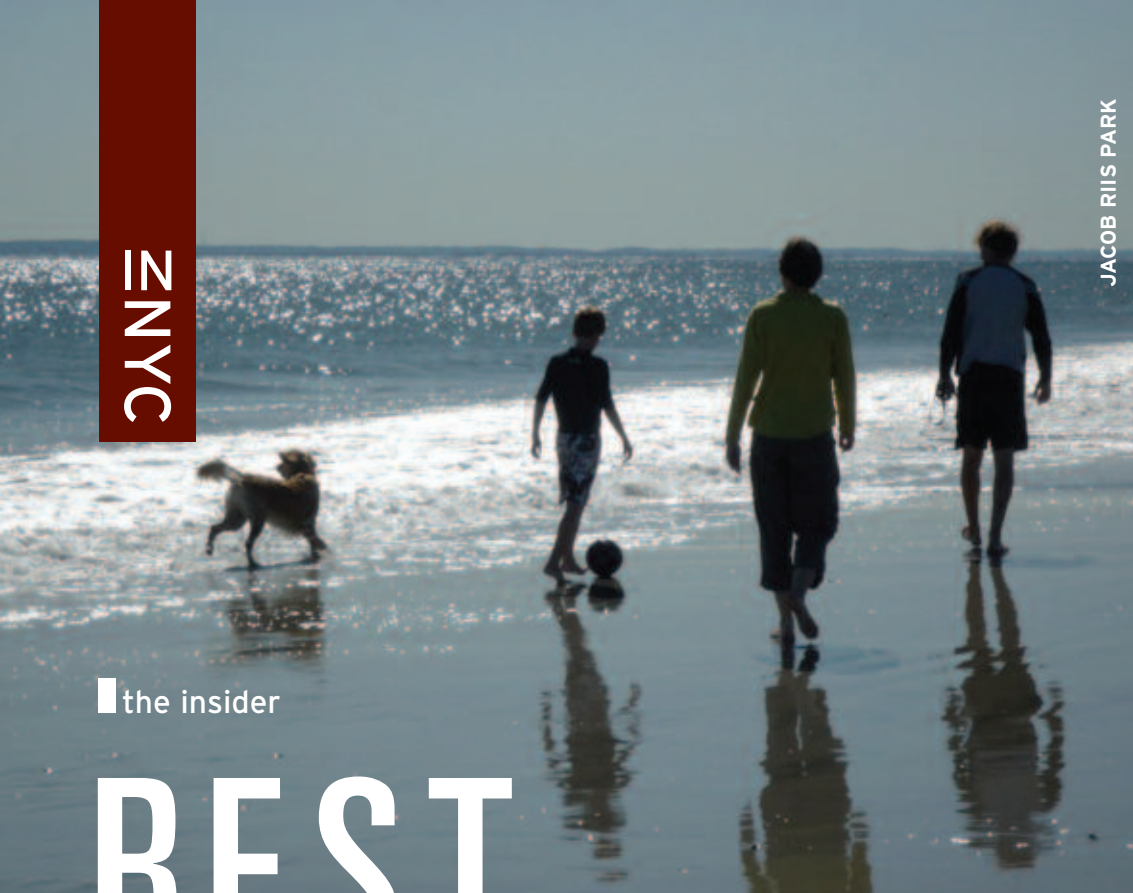
JACOB RIIS PARK