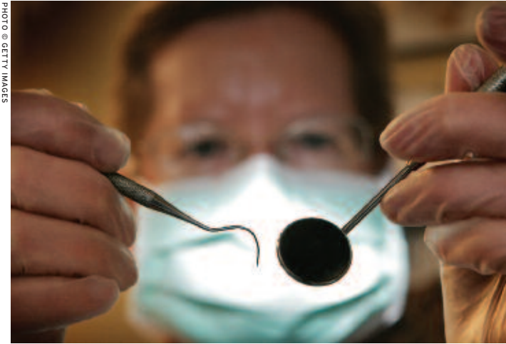
WHILE NOT A WELCOME SIGHT FOR MOST PEOPLE, THE VIEW FROM THE DENTAL CHAIR IS ESPECIALLY HARROWING FOR TORTURE SURVIVORS.

H arsh, blinding lights; the piercing sound of a drill; a stranger wielding sharp, metal tools near your face. Most people dread, yet deal with, these discomforts when they visit the dentist. But for victims of torture and sufferers of post-traumatic stress disorder, the experience can be infinitely more intense, reminding them of a time when they were subjected to horrors at the hand of someone who intended them bodily harm.