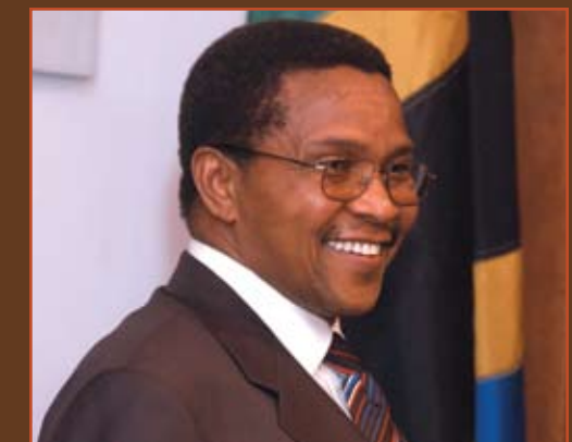
President Kikwete of Tanzania

Africa House collaborated with the Africa Travel Association to host ATA's First Annual Presidential Forum Promoting Positive News from Africa. His Excellency Jakaya Mrisho Kikwete President of the United Republic of Tanzania and the Honorable Chief Olufemi Fani-Kayode Minister of Culture and Tourism, Federal Republic of Nigeria both spoke.