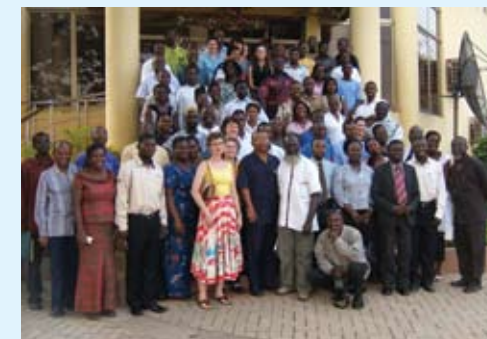
The KNUST symposium participants