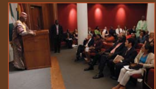
Minister Fani-Kayode of Nigeria