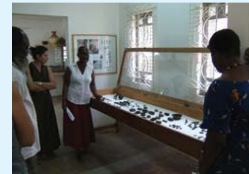
NYU and Metropolitan Museum representatives viewing Kumasi's Kwame Nkrumah University of Science and Technology (KNUST) museum holdings

On Thursday, November 30th, NYU in partnership with the Kwame Nkrumah University of Science and Technology (KNUST) in Kumasi, organized a conference on the critical issues surrounding the production, dissemination, conservation and collecting of Ghanaian art. Discussants included the visiting American scholars and Metropolitan Museum representatives, KNUST art historians and leading figures of the Ghanaian art world. The two public panel discussions held at the KNUST campus drew an audience of over one hundred Ghanaian art scholars and students and provoked a dynamic and stimulating debate.